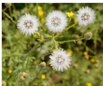
Udo Schmidt (CC BY-SA 2.0)