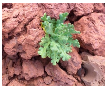
Silvia Naches García (©FCRMBLP)

1. If the plant has bloomed and/or seeded (forming a pappus or bristle ball):