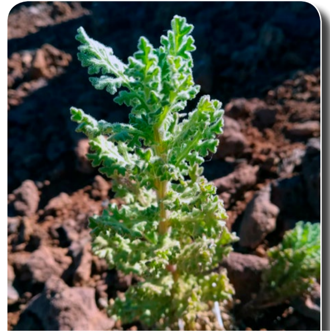
Adult plant, before blooming. © Antonio Rodríguez Lerín